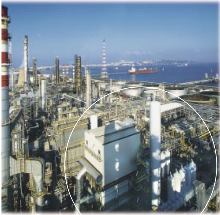
Linde steam-reformer, Milazzo, Italy

Hydrogen is generally considered as the potential energy carrier of the future, replacing traditional hydrocarbon-based energy sources by renewable ones in the long term. But even today under special niche-conditions, hydrogen produced for instance by electrolysis already can be economical and thus make hydrogen attractive as fuel for mobile applications. New hydrogen applications for fuel cells will gain an additional share in the hydrogen market which is presently dominated by the chemical and refining industry.