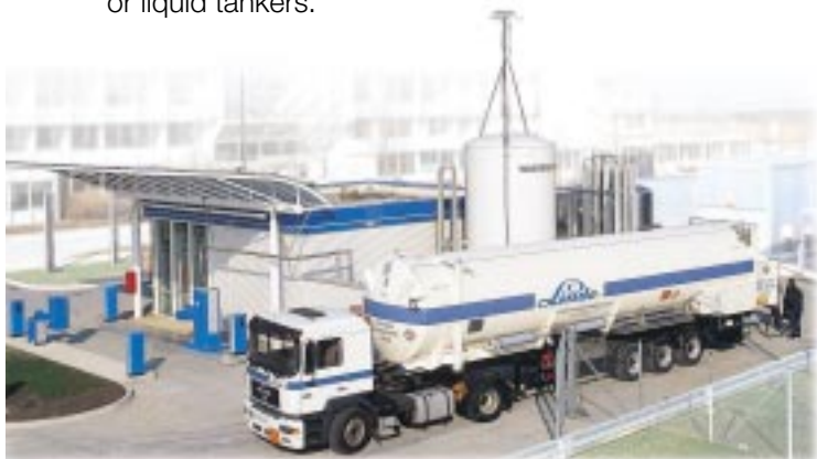
LH 2 fuel station, Munich, Germany

Cost-effective hydrogen production is just “one side of the coin”. The other side is the transport of the hydrogen from the production plant to the consumer. Linde logistics covers all kinds of transport from small hydrogen cylinders up to large-scale pipeline networks. In the chemical area of Leuna Linde operates Europe’s most modern pipeline system for hydrogen. Customers with a demand for a GH 2 /LH 2 on-site storage system receive hydrogen from special high pressure gas trailers or liquid tankers.