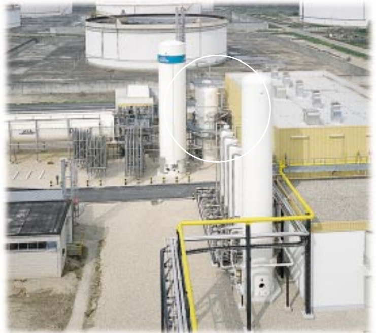
Linde liquefier, Ingolstadt, Germany

The industrial process most commonly used nowadays for the large-scale production of hydrogen is "steam-reforming". Linde has worldwide built numerous steam reforming plants with capacities ranging from appr. 1,000 to 100,000 Nm 3 /h H 2 . At Leuna, Germany, and Milazzo, Sicily, Linde supplies refineries and a whole industrial complex with hydrogen from its own large capacity on-site plants. Additional reformers in France and Germany operated by Linde will come onstream at the beginning of 2000. In the US, at LaPorte Texas, Linde is supplier of syngas to Millenium Chemicals located in the largest petrochemical industrial complex of the world.