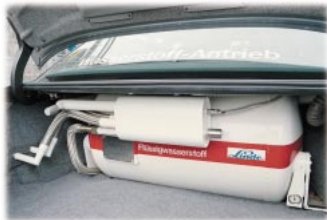
BMW research vehicle with Linde LH 2 tank

In different hydrogen research projects Linde has been engaged from the very beginning. Linde participated in the joint venture of the “Solar-Wasserstoff-Bayern GmbH” in Germany, where the essential components for a solar hydrogen system were investigated. For the European “Ariane” rocket Linde built the hydrogen infrastructure for the test facilities of the “Vulcain” engine.