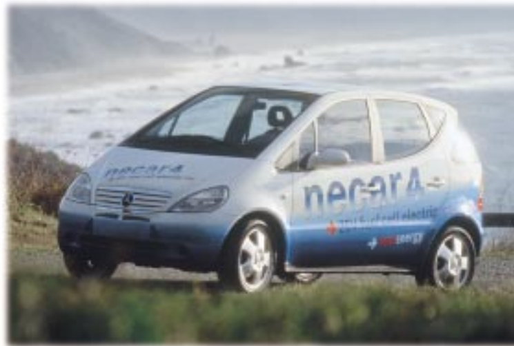
“NECAR4” fuel cell car from Daimler Chrysler with Linde LH 2 tank