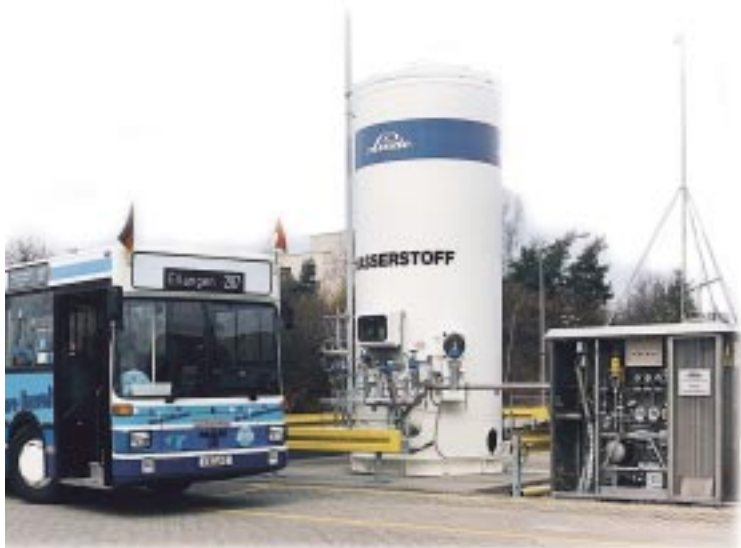
LH 2 fuel station for MAN City Bus, Erlangen, Germany

At the Munich airport Linde has built in collaboration with MAN, BMW, Aral and other partners the world’s first public fuel station for liquid hydrogen. As a novelty the filling of the LH 2 car-tanks happens fully automatically with a robot. In a parallel operation gaseous high pressure hydrogen is supplied to shuttle buses conveying passengers at the airport. Furthermore Linde is engaged in a concept study investigating the hydrogen infrastructure of airports for DaimlerChrysler Aerospace.